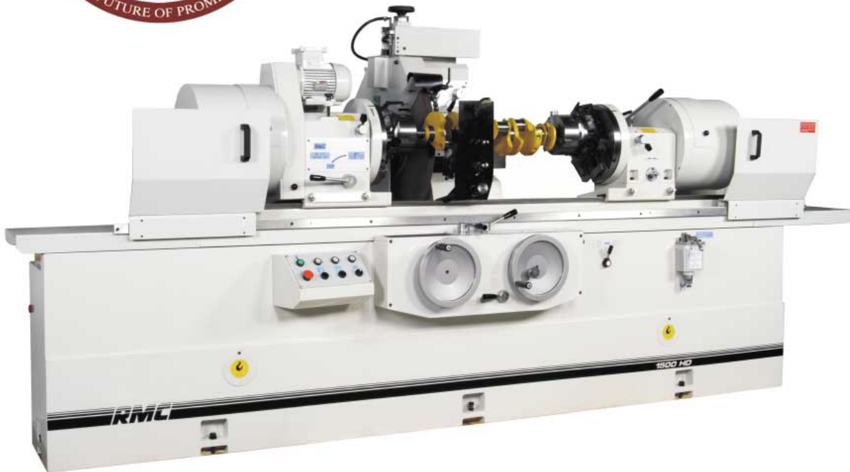
RMC-1500HD shown above

RMC Crankshaft Grinders are designed with state-of-the-art technology to utilize the most accurate and efficient crankshaft setup system available. RMC's built-in features benefit the serious rebuilder who is grinding welded crankshafts or crankshafts with special stroke requirements. High performance Engine Builders particularly appreciate the ability to modify or maintain the existing stroke with the utmost accuracy and repeatability.